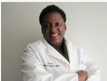
September 2022 Journal Club

At each Journal Club a volunteer member of DO-Touch.NET will lead a discussion about a recently published journal article related to OMM research.