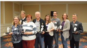
July 2022 Network Update

At each Network Update we work to give the attendees and viewers and update of all the current and upcoming research and events opportunities available to DO-Touch.NET Members.