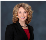
August 2022 Educational Webinar

At each Network Update we work to give the attendees and viewers and update of all the current and upcoming research and events opportunities available to DO-Touch.NET Members.